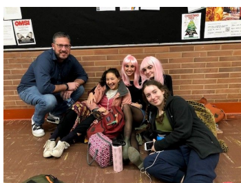
WHS students enjoying spirit week ("twins day").